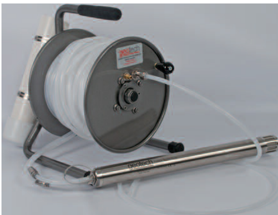
Portable Bladder Pump Reel System (shown with 1.66 Pump)