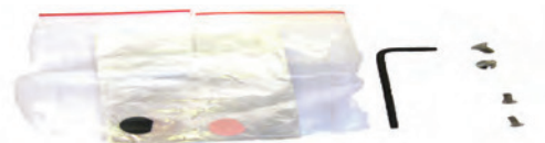
Foil Service Kit 3853. PS 3