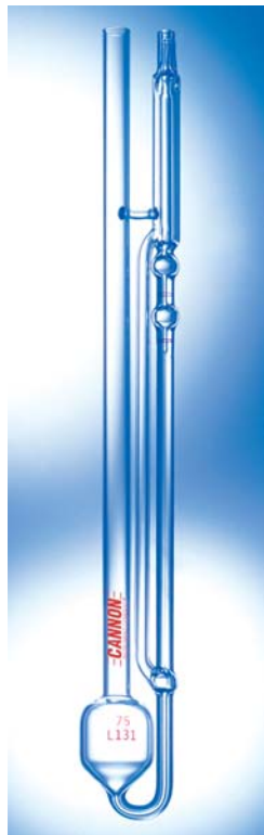
9722-G50 Series 9722-H50 Series