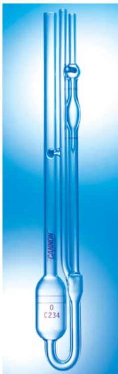
9721-N50 Series 9721-R50 Series 9721-U50 Series