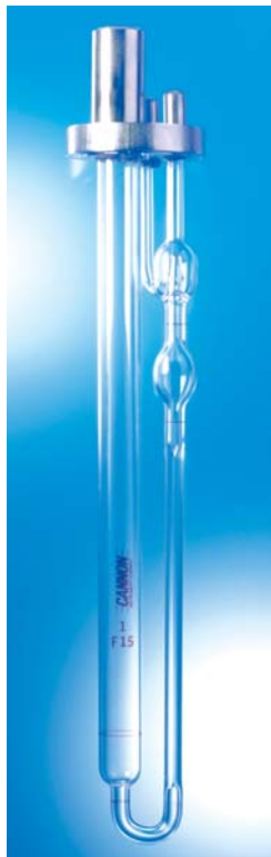
9723-A50 Series 9723-B50 Series