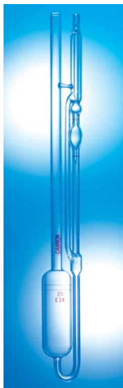
9722-L50 Series 9722-M50 Series