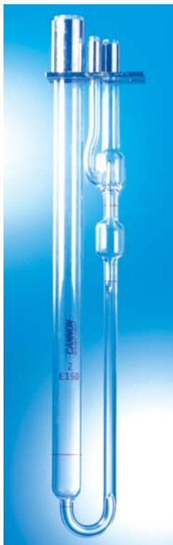
9723-C50 Series 9723-D50 Series

Similar to 9723-B50 series, but uncalibrated.