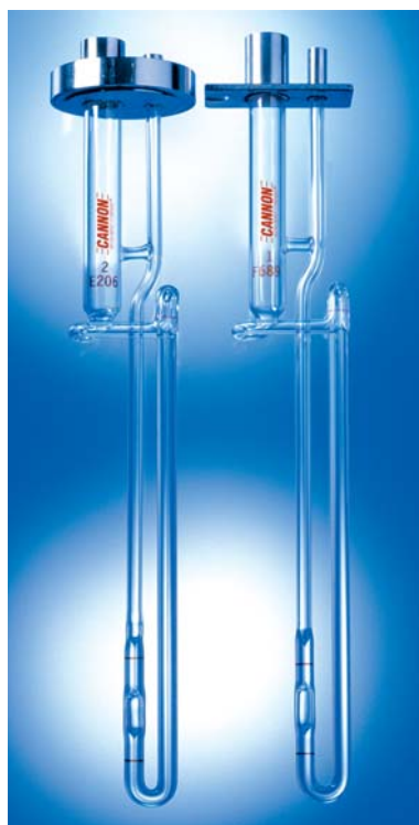
9723-W50 Series 9723-Y50 Series 9724-B50 Series 9724-D50 Series