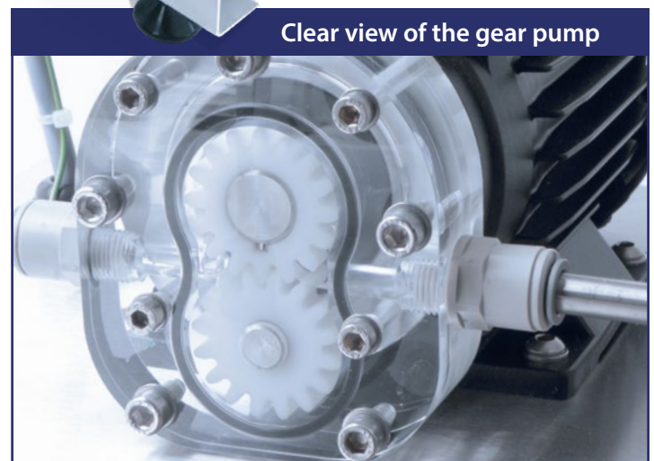
Clear view of the gear pump