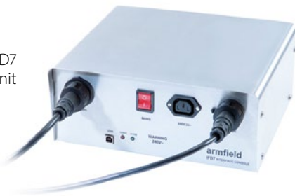
Armfield IFD7 Interface Unit

The IFD7 also provides the conditioning electronics for the sensors and allows their readings to be displayed on the computer software.