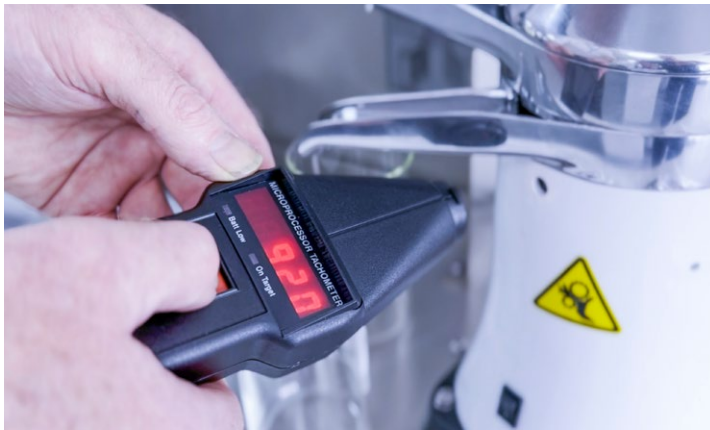
FT15 Optical Tachometer