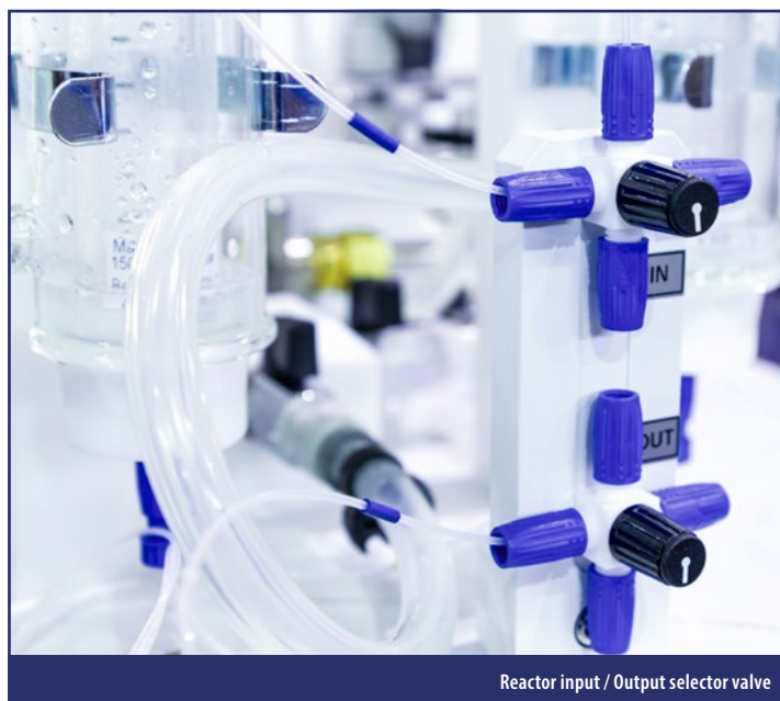
Reactor input / Output selector valve