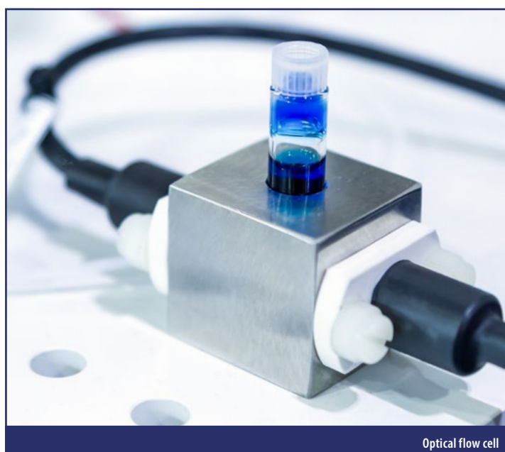
Optical flow cell