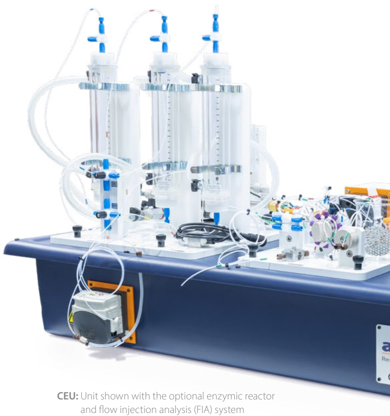
CEU: Unit shown with the optional enzymic reactor and flow injection analysis (FIA) system

A colorimetric assay is used to determine the degree of conversion using an optical sensor. Assays may be automated using optional flow injection analysis.