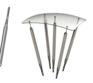
Ultra Feather Touch probes checking a glass form