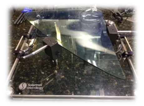
Feather Touch probes are often used to check Automotive Glass