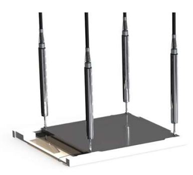
High resolution means precise glass flatness measurements