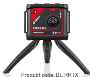
Product code: DL-RHTX