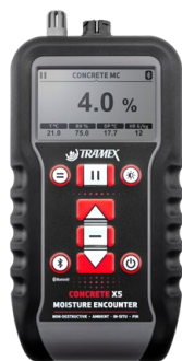
Product code: CMEX5

The probes can be used with the CMEX5, MEX5 and Feedback Datalogger RHTX for relative humidity testing in building structures and ambient conditions.