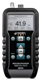
Product code: MEX5